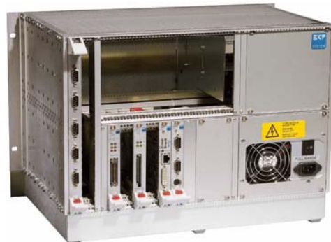
CR7-XX-RACK (Custom Specific)