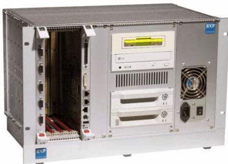
CR7-XX-RACK (Custom Specific)