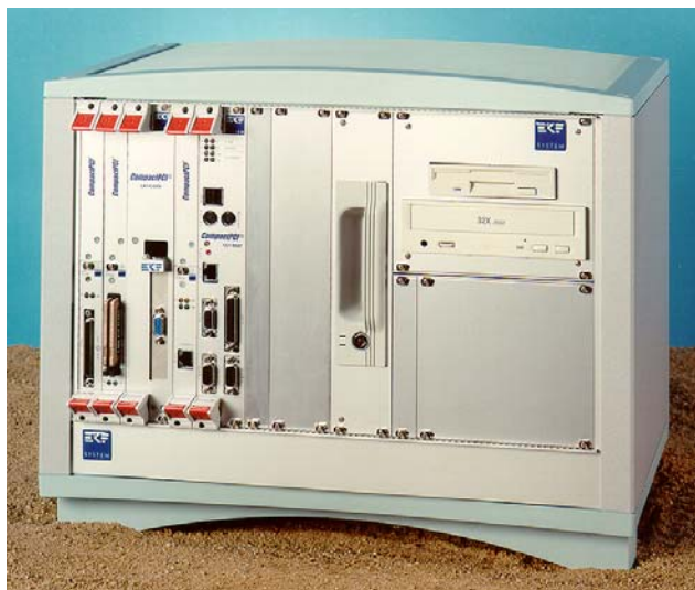
CR7-XX-RACK (Custom Specific)

Additional options and ordering numbers see product information CD1-OPERA and CD2-BEBOP